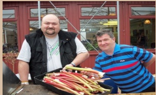
Rhubarb Grown for Erskine Hospital Kitchen by Gardening Leave.