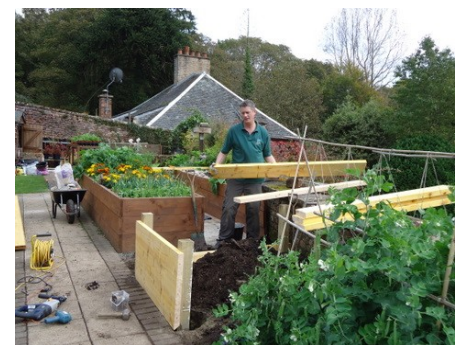
Veteran working on raised beds at Auchincruive.