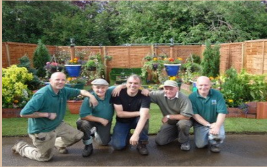
Veterans who helped Gardening Leave win a 3rd Gold Medal at The Ayr Flower Show 2011.

Gardening Leave Auchincruive was the first project and where head office is based.