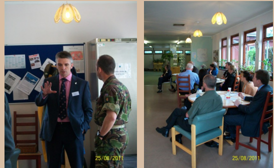
The Networking Event which was held in August was very well received.

Gardening Leave Erskine the 2nd project to open, is situated within the grounds of Erskine Hospital.