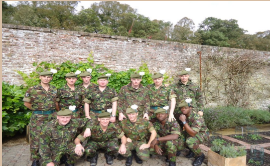
Soldiers from 2nd Battalion The Royal Regiment of Scotland C Coy gave up their free time to come and help out for a day.