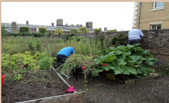
Work on the new site next to the Infirmary has already begun.

Gardening Leave Chelsea, within the grounds of the Royal Hospital Chelsea is the 1st Gardening Leave site opened in England.