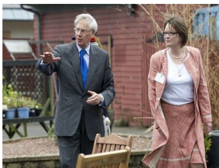
HRH Duke of Gloucester visits GL Erskine.