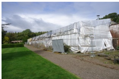
The Stovehouse under reconstruction.

The Stovehouse is an 84 metre long Victorian greenhouse situated in the Ornamental Gardens at Auchincruive. Our Stovehouse Supervisor Hugh 'Stevie' McAulay and his team of volunteers and veterans are making great progress with the restoration. As mentioned before they have stopped taking things apart and are now putting things together again with the repairs and when they are completed, we will be able to expand the scope of our therapeutic activity (especially in winter) to include art, woodwork and more valuable indoor growing space.