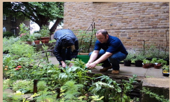
Harvesting crops on the terrace.